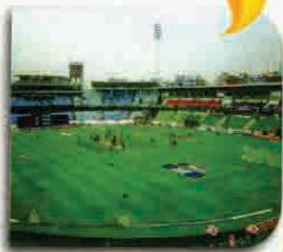
International Cricket Stadium