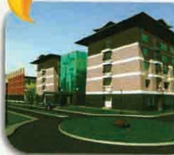
SVIMS Medical College