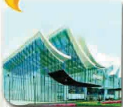
International Airport of TIRUPATI